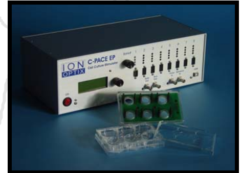
C-Pace EP Cell Culture Pacing System