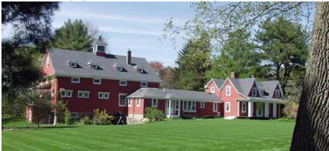
“The Barn” — IonOptix Headquarters in Milton, Massachusetts