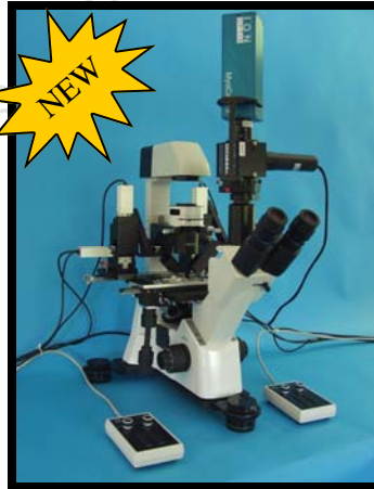
Myocyte MyoStretch Force, Calcium & Contractility System